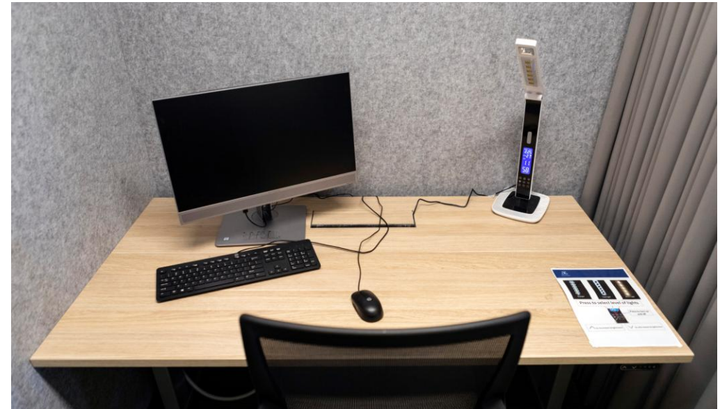
Melbourne Graduate School of Education